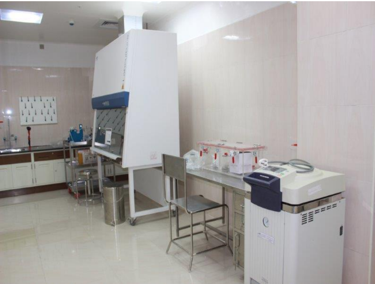
Inoculation Room, Challenge Area