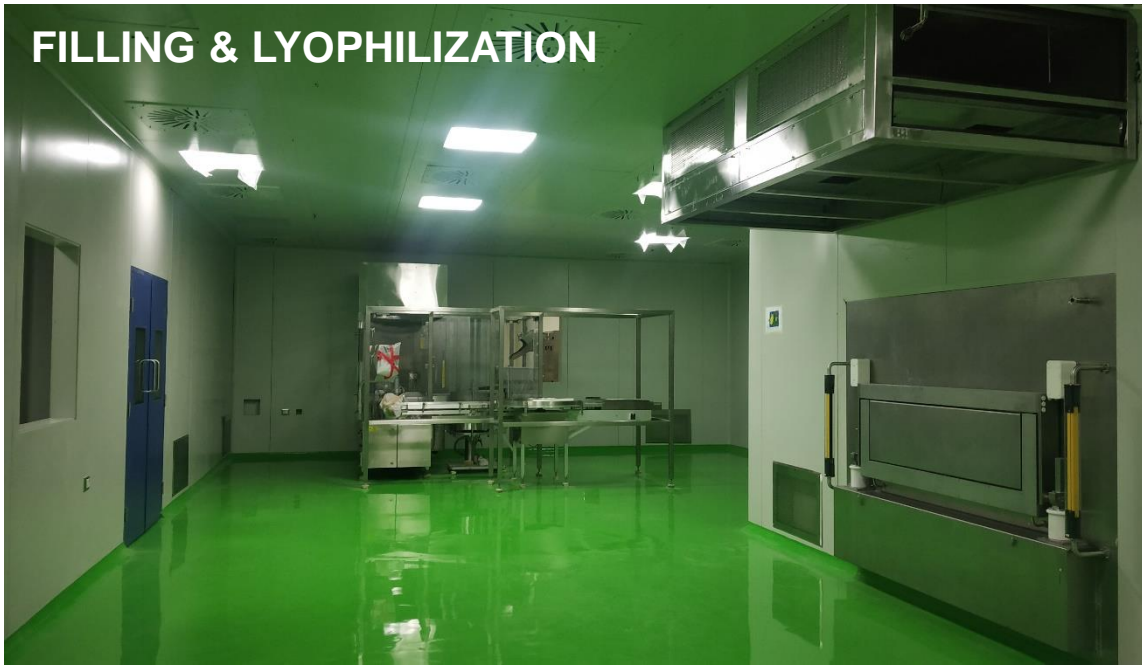
FILLING & LYOPHILIZATION