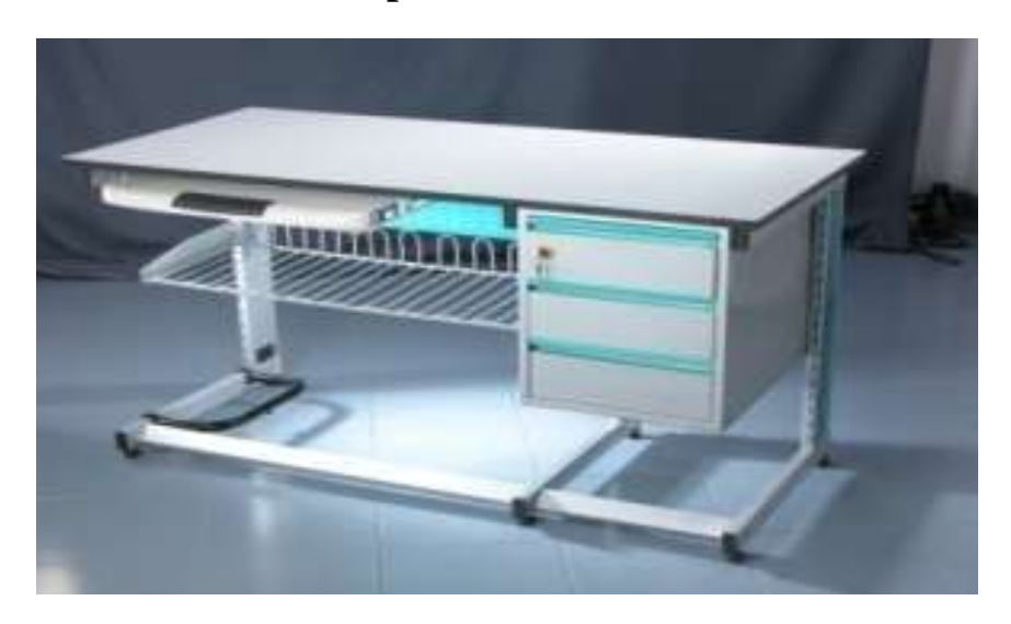
Table Size:- Length: 1300mm, Width:600MM, Height: 750mm

C- Frame & Tubular cold rolled close annealed Steel Structure. Fabrication involves only MIG/TIG & Spot welding. Top & shelf made of 18mm thick pre-laminated particle board. Edge beading of edges by Through Feed Machine. Shelf adjustable on steel brackets. Removable tubular CPU stand and an embossed modesty panel below table top provided. Provision for wire management. Drum Type Leveller. Fitted with 3 drawer storage box. (W 350mm D 575mm H 430mm). All steel components are epoxy powder coated after seven tanks anti corrosion treatment of surface. The overall appearance of the product shall be as per photograph.