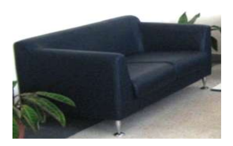
Item No. 48: Sofa 3 Seater

Straight-line Sofa 3 Seater Overall- Size-H-700 mm, L-1730 mm, D-800 mm.