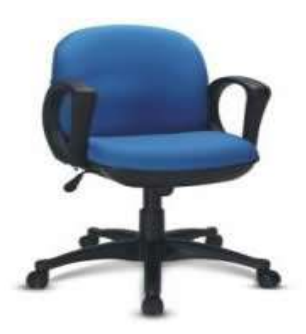
Item No. 25: Staff chair #1

The seat/back shall be made up of 1.2 \pm 0.1 cm thick hot pressed plywood measured as per QA method desirable in OCP-QLTA-P14-18 and upholstered with fabric and moulded Polyurethane foam together with moulded seat and back covers. The back foam shall be designed with contoured lumbar support for extra comfort. The dimensions of back shall be-50.0 cm (W) x 49.0 cm (H) and of seat shall be- 50.0 cm (W) x 46.5cm. (D).