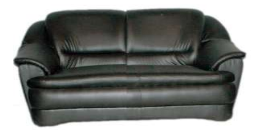
Item No. 46: Premium Sofa 2 Seater with matching centre table

Deluxe Sofa 2 Seater Overall- Size-H-870 mm, L-1450 mm, D-840 mm. Structure made of treated agro wood, fitted with 50mm wide rubberized belts 50mm wide with high density PU foam as per design, Upholstered with premium quality PU cloth with help of stitching, where ever necessary. Overall appearance as per photograph. Tapestry- 05 Mtr.