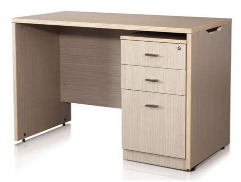
Table with Drawer

The desk comprises of a Worktop made of pre-laminated MDF board OS, Side panels and Modesty panel and a freestanding pedestal. The entire desk unit is assembled with suitable KD fittings and hardware. Each side panel is provided with a cutout for laying cables for the monitor and other computer accessories.