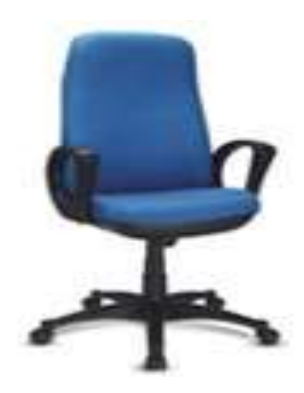
Item No. 21: Premium Visitors Chair with wheels