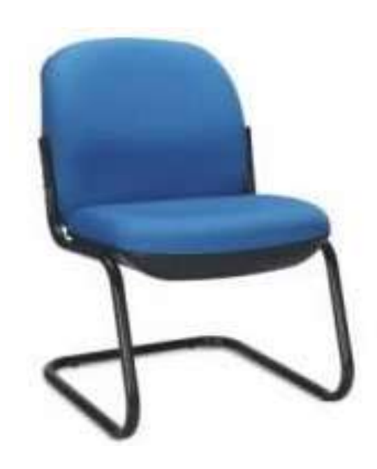
Item No. 28: General Purpose Chair without armrest