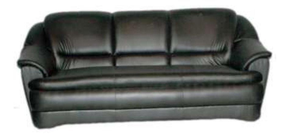
Item No. 45: Premium Sofa 3 Seater with matching centre table

Deluxe Sofa 3 Seater Overall - Size-H-870 mm, L-1940 mm, D-840 mm. Structure made of treated agro wood, fitted with 50mm wide rubberized belts 50mm wide with high density PU foam as per design, Upholstered with premium quality PU cloth with help of stitching, where ever necessary. Overall appearance as per photograph. Tapestry- 06 Mtr.