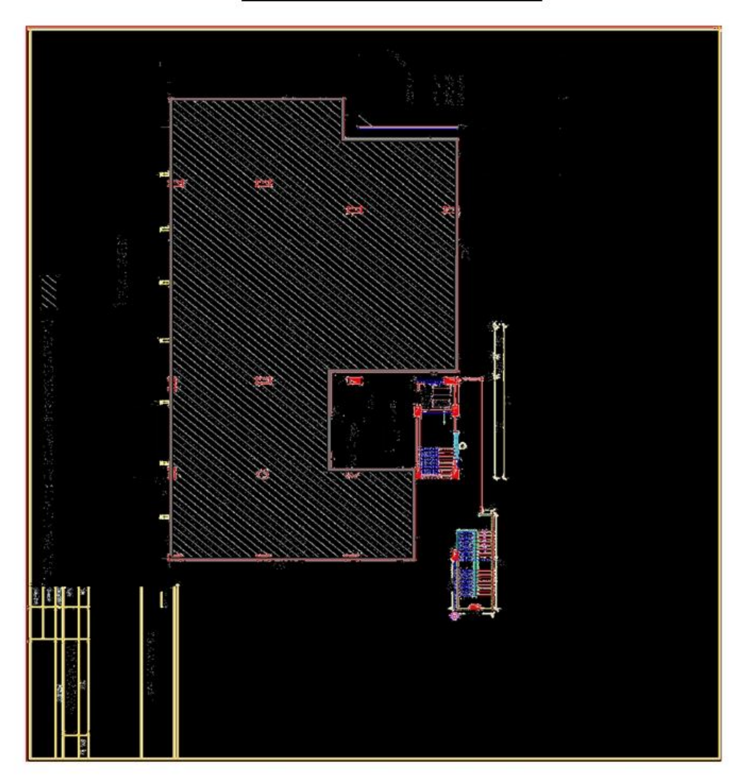
HLL/AFT/PROJ/2013-14/TENDER/FGSA/01 DRAWING NO.1 - PLAN OF SITE (Terrace)