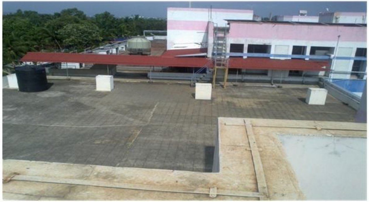
View From top of machine room