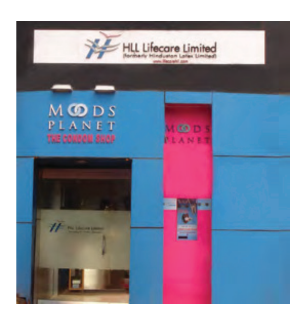
The Moods Planet Condom Shop of HLL in Thiruvananthapuram, Kerala is a one-stop facility for the complete range of HLL contraceptives, with a Moods Condom Vending Machine on 24x7 mode.

reach of over 70 percent of the Government brands - Deluxe NIRODH and MALA-D nationally.