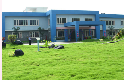
Irapuram Facility, Cochin