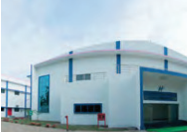
Unipill Block, Kanagala