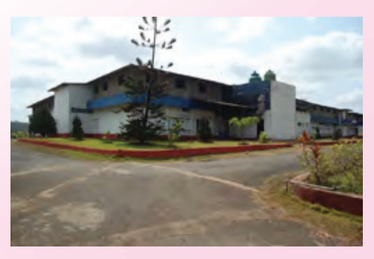
Goa Antibiotics and Pharmaceuticals Limited